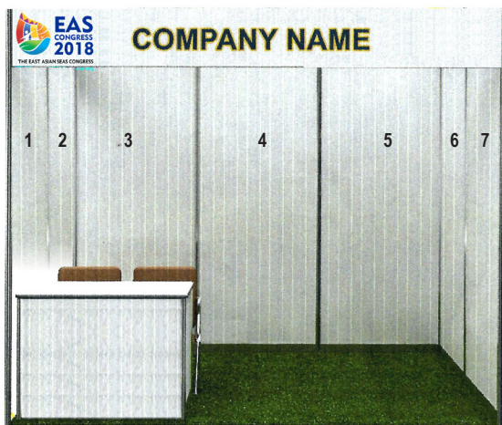
Layout: 3.00 (W) x 2.00 (L) x 2.5 (H)